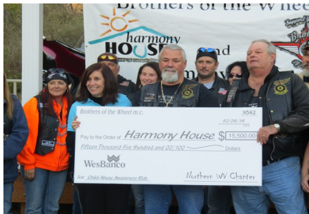
The Brothers of the Wheel presenting Harmony House with $15,500. Since 2006 they have raised over $102,000

Children are often the silent victims of drug abuse and domestic violence. Please seek help if you and your children are living in this kind of situation.