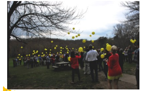
"Hope for Spring" Fling

This year we have held three successful fundraisers. We would like to thank all our sponsors, donors of auction items, and everyone who bought a ticket to support an event(s).